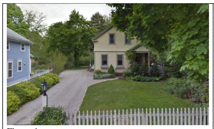
Figure 1. 48 Church Lane (the house is gray now).

Joe and Phil will be providing the burgers and dogs and a few other things.. Each 'boat' may bring an appetizer and also please bring your own drinks (BYOB). Ice and coolers and basic mixers (e.g. ginger beer) will be provided.