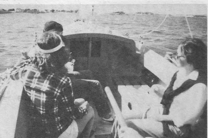
You sit in her, not on her. Solid teak seats and the high teak coamings surrounding her deep cockpit give you a feeling of comfort and security.