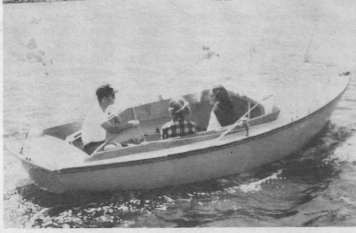
Her amazing 8 foot cockpit affords more room to stretch out and relax than most 30 footers.